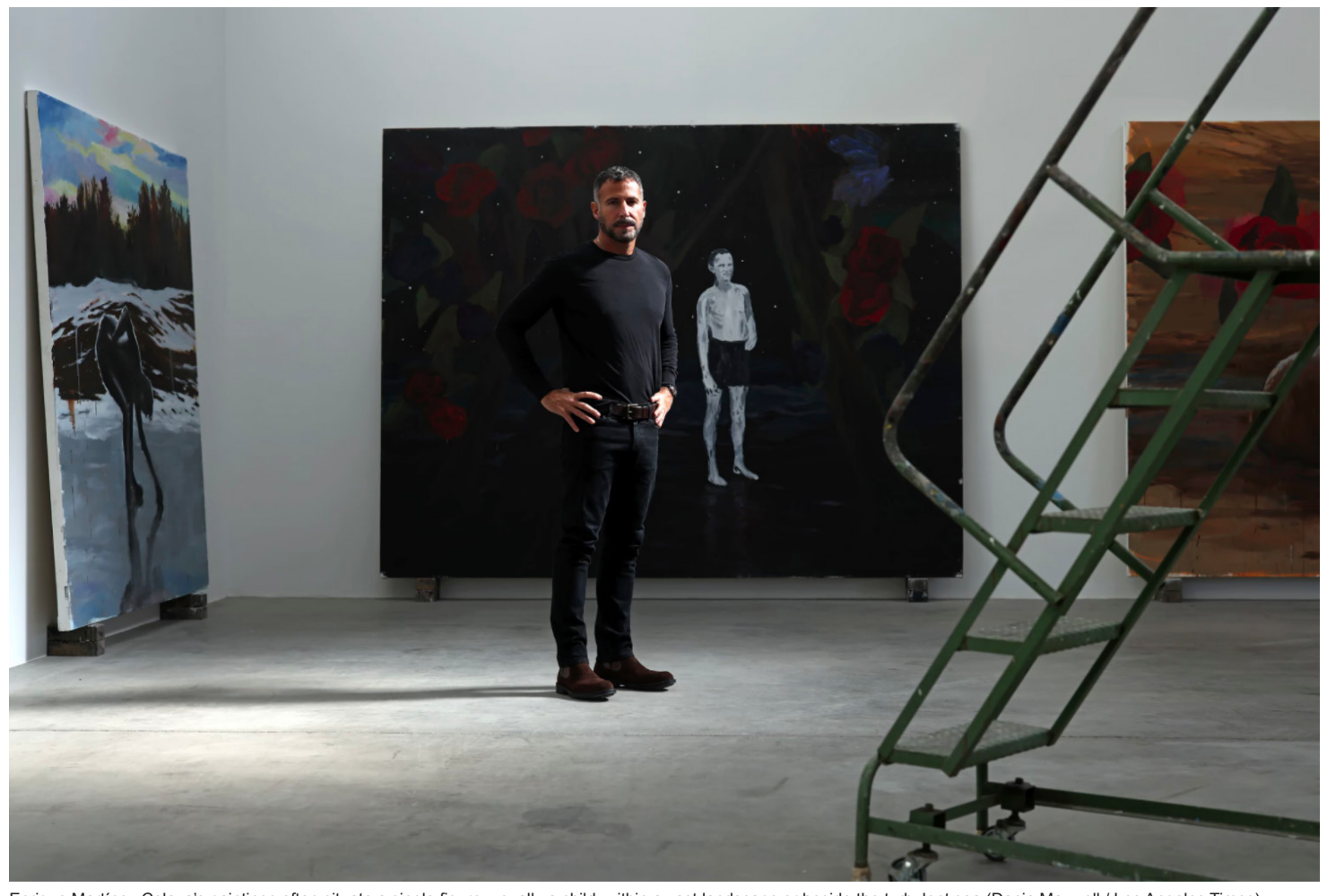
Enrique Martínez Celaya's paintings often situate a single figure, usually a child, within a vast landscape or beside the turbulent sea.