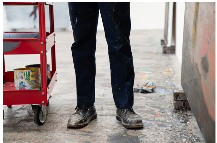
Standing among “The Tears of Things.”