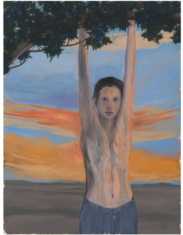
Enrique Martínez Celaya, The Prince , 2015. Oil and wax on canvas, 66 x 50 inches. Courtesy Robischon Gallery.

Another curious painting, a beauty, is that of a skate with a boy resting his head on it, his body tucked into fetal position, a rather strange pillow cum security blanket. Depicted in transparent, tremulous pink, white, and blue—like flesh or the skirt of a ballerina—Martínez Celaya contrasts the enchanting with the mundane, the lush with the bleak.